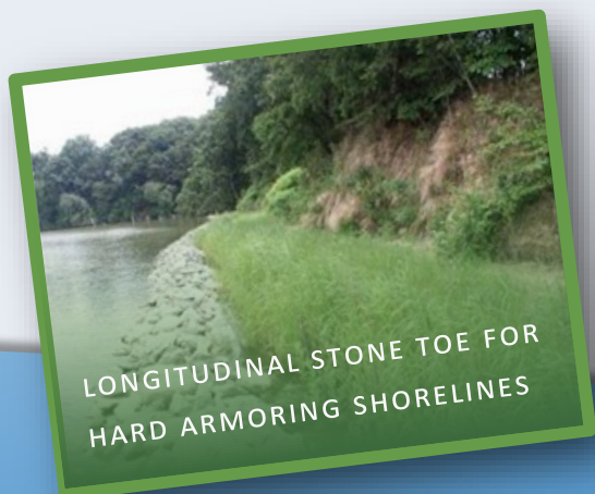
LONGITUDINAL STONE TOE FOR HARD ARMORING SHORELINES